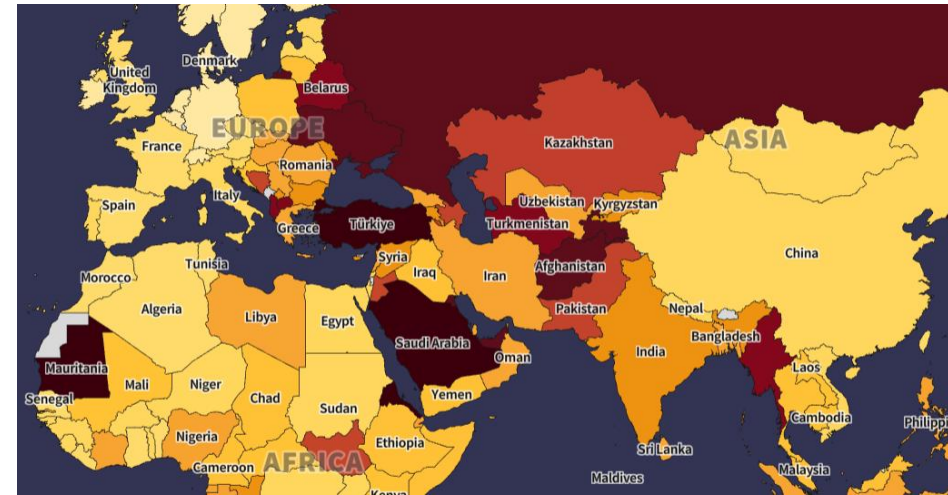
Image from Modern Slavery Index showing prevalence of modern slavery around the world

Where factories are not able to supply a valid audit from our preference list, we will consider others by exception to reduce audit fatigue. Where factories do not hold audits and it is not financially viable for them to go down this route, we have created our own supplier questionnaire to encourage best practice.